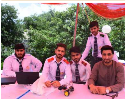
REGIONAL SCIENCE OLYMPIAD ORGANIZED BY DEPARTMENT OF SCIENCE AND TECHNOLOGY GOVT. OF KP (12 th JUNE 2019)